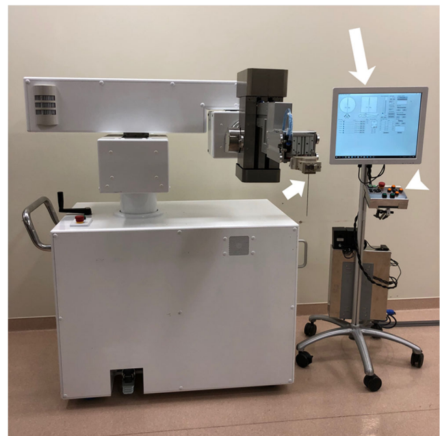
Fig. 1 The robotic system. A robot (left) with 6 degrees of freedom and an interface (right) comprising a touch panel (long arrow) and a controller (arrowhead). The robot may be manipulated by either button operation of the controller or numerical inputs on software displayed on the touch panel. With the former technique, the robot moves while the buttons of the controller are manually pressed, whereas with the latter technique, the robot moves to a certain place semi-automatically after numerical inputs. In the present study, typically, alteration of needle angles for needle targeting and adjustment of needle orientation was performed by the latter, while needle insertion was done by the former. The needle (short arrow) is attached to a plastic needle holder at the end of a robot arm

The phantom experiment was designed to evaluate the angle accuracy of robotic needle insertion, freehand manual insertion, and manual insertion guided by a smartphone (iPhone 6,