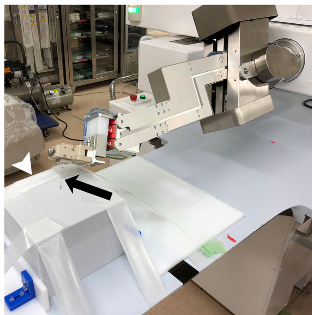
Fig. 2 Robotic out-of-plane needle insertion in the phantom experiment. The needle (arrow) at the predetermined angles in the XY and YZ planes is inserted into a sponge phantom (arrowhead) fixed on the CT table

The needle angle was measured in maximum intensity projections in the two planes at a CT console by a blinded author (S.O. with a 3-year experience in CT-guided interventions). The angle error was calculated as the difference between the predetermined angle and the angle after insertion. Then, the