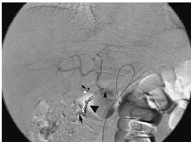
Fig. 1 Arteriogram via port shows that all hepatic arteries are well-visualized. The catheter tip is inserted into the gastroduodenal artery (arrow). The side hole is placed into the common hepatic artery (small arrowhead). To prevent an extrahepatic influx of anti-cancer agents, the gastroduodenal artery (arrowhead) and right gastric artery (small arrow) are embolized with microcoils.

Radiological placement of the port-catheter system was performed at 14, 20, and 21 days after surgery (Fig. 1). All placement procedures were performed in an angiography suite under local anesthesia. Prior to catheter placement, the patients underwent angiography and arterial embolization to allow arterial mapping and prevent extrahepatic influx of 5-FU; these procedures were performed using a 4-French angiographic catheter (Clinical Supply, Gifu, Japan) that was inserted from the left femoral artery. The extrahepatic arteries that branched from the hepatic artery such as the right gastric artery and the posterior superior pancreaticoduodenal artery were embolized with microcoils (Trufill; Cordis, Miami Lakes, FL, USA) through a 2.1-French microcatheter (Sniper 2; Clinical Supply) inserted coaxially. Next, a 4-French angiographic catheter was inserted from the right femoral artery and advanced to the common hepatic artery via the celiac artery. An indwelling catheter (W spiral catheter; PIOLAX, Yokohama, Japan) with a side hole was then inserted using the catheter-exchange method. The catheter tip was inserted into the gastroduodenal artery such that the side hole was placed in the common hepatic artery. The gastroduodenal artery around the tip of the indwelling catheter was embolized using microcoils