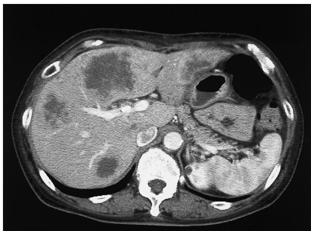
Fig. 2B Contrast-enhanced CT image obtained after 3 HAIC cycles showing smaller liver metastases. The percentage of liver involvement with metastases improved from 42.8% to 33.9%.

cause their liver metastases progressed; HAIC was therefore readministered to both patients (16 times for one patient and 6 times for the other). The case 1 patient succumbed to the disease 488 days after HAIC was initiated; case 3 succumbed after 333 days.