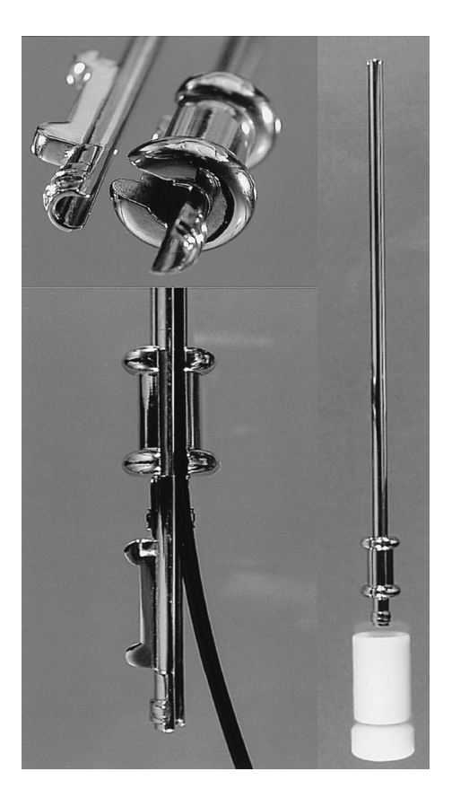
Fig. 2 Insertion of a flexible ureteroscope mounted inside the access sheath.

For these reasons, we believe the detachable access