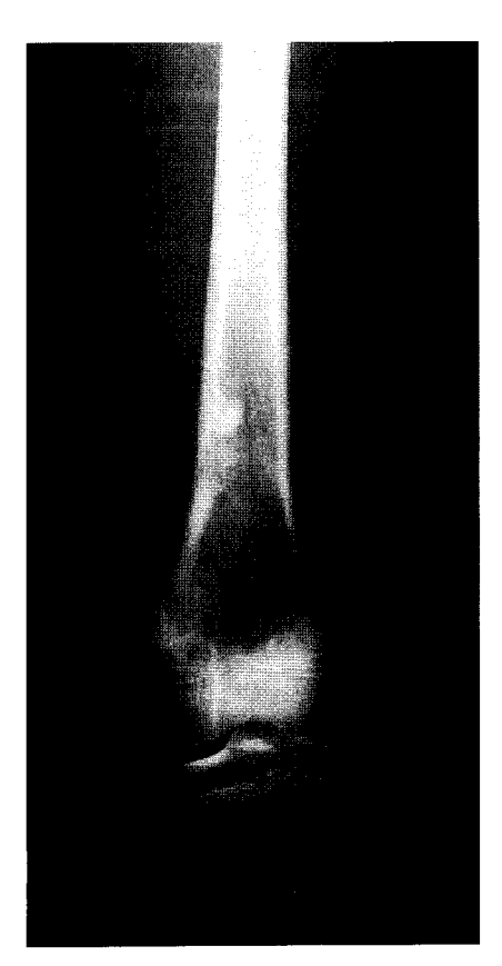
Fig. I Radiograph showing abnormal sclerotic change and periosteal reaction at the distal end of the femoral shaft upon the initial presentation.

(CT) and magnetic resonance (MR) imaging demonstrated extraskeletal invasion of the tumor from the left distal femur. Bone scan revealed a "hot spot" on the left distal