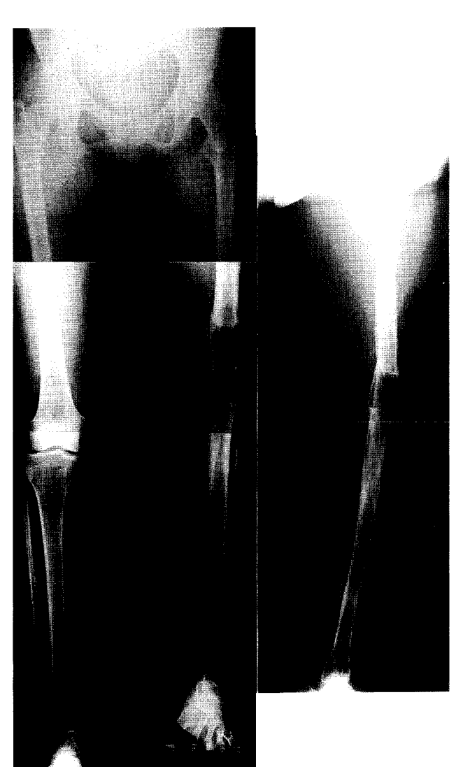
Fig. 4 Anteroposterior and lateral radiographs taken two months after removal of the apparatus, showing sufficient union of the docking and elongated sites.

length had been maintained (Fig. 4). The discrepancy in leg lengths is currently corrected by a thick-heeled shoe. Clinical and radiological examinations revealed neither local recurrence nor distant metastasis. The patient can walk by herself without support.