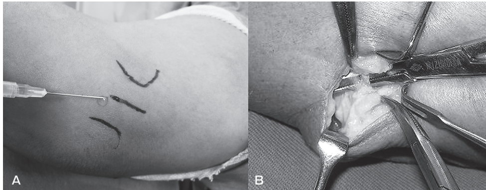
Fig. 1 Surgical procedure for the release of Osborne's ligament with a small incision using window technique. A , Local anesthesia was done on the cubital tunnel between the medial epicondyle and the medial border of the olecranon; B , Osborne's ligament was released.

dage fixation was applied, and active movement of the elbow joint was initiated after 2–3 days.